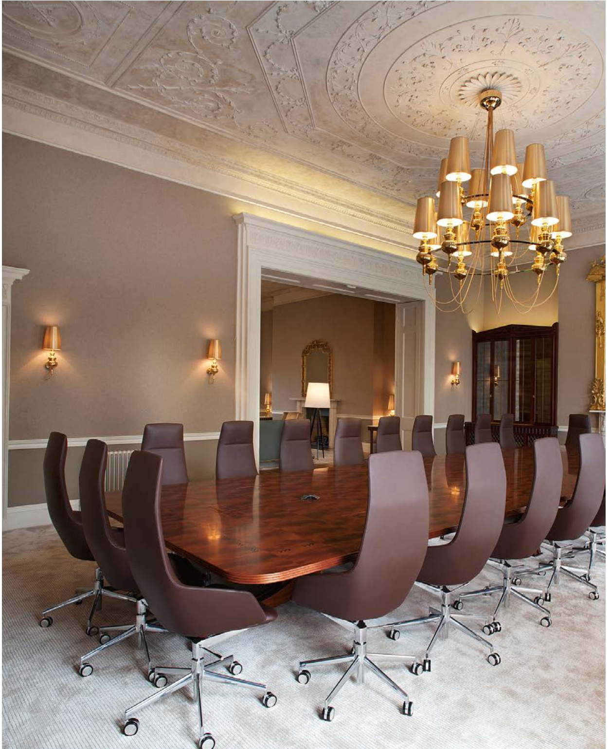
No 8 St. Stephens Green Dublin, Ireland Art. 1924 Direction