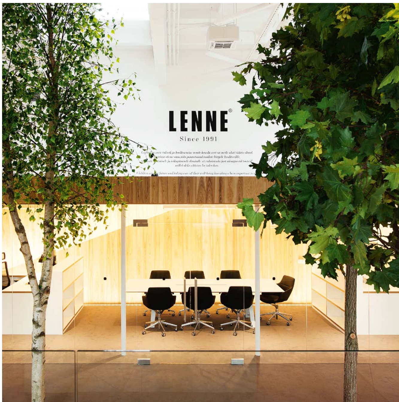
Lenne HQ Tallinn, Estonia Art. 1933 Conference